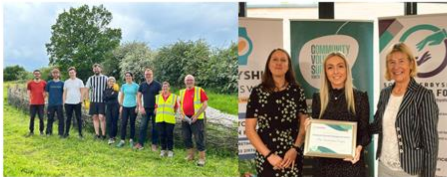
Corporate Volunteer Engagement Award (Runner-Up) – Price Waterhouse Coopers for their work with Findern Footpaths and Conservation Group Butterfly Mound Project .