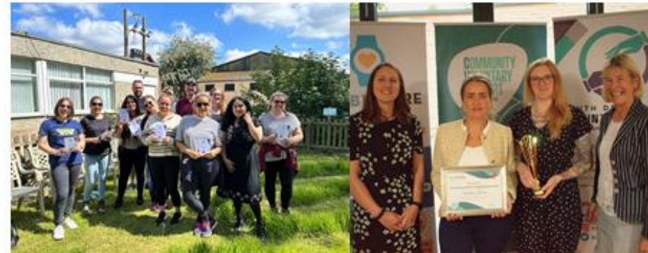
Corporate Volunteer Engagement Award (Winner) - Waldon Telecom for their work with St George and St Marys Church Community Garden Project .