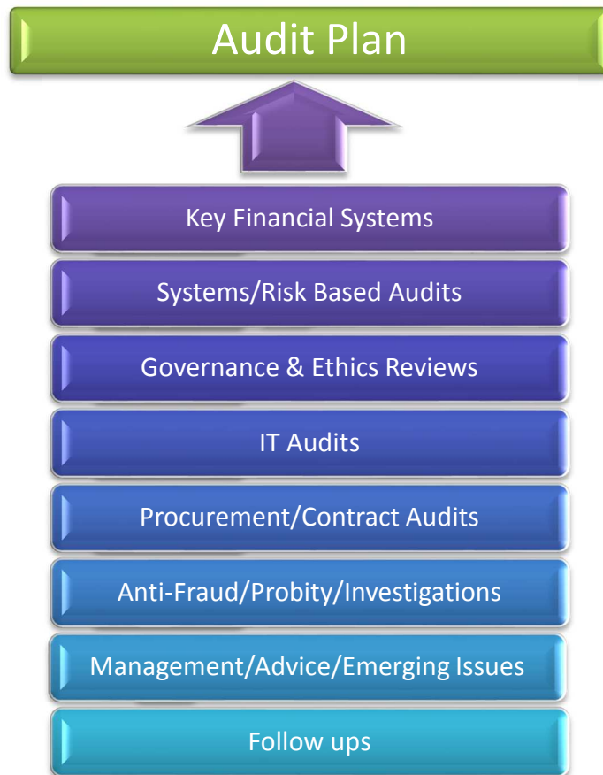
Audit Plan 2017-18 Time Allocation per Type of Audit