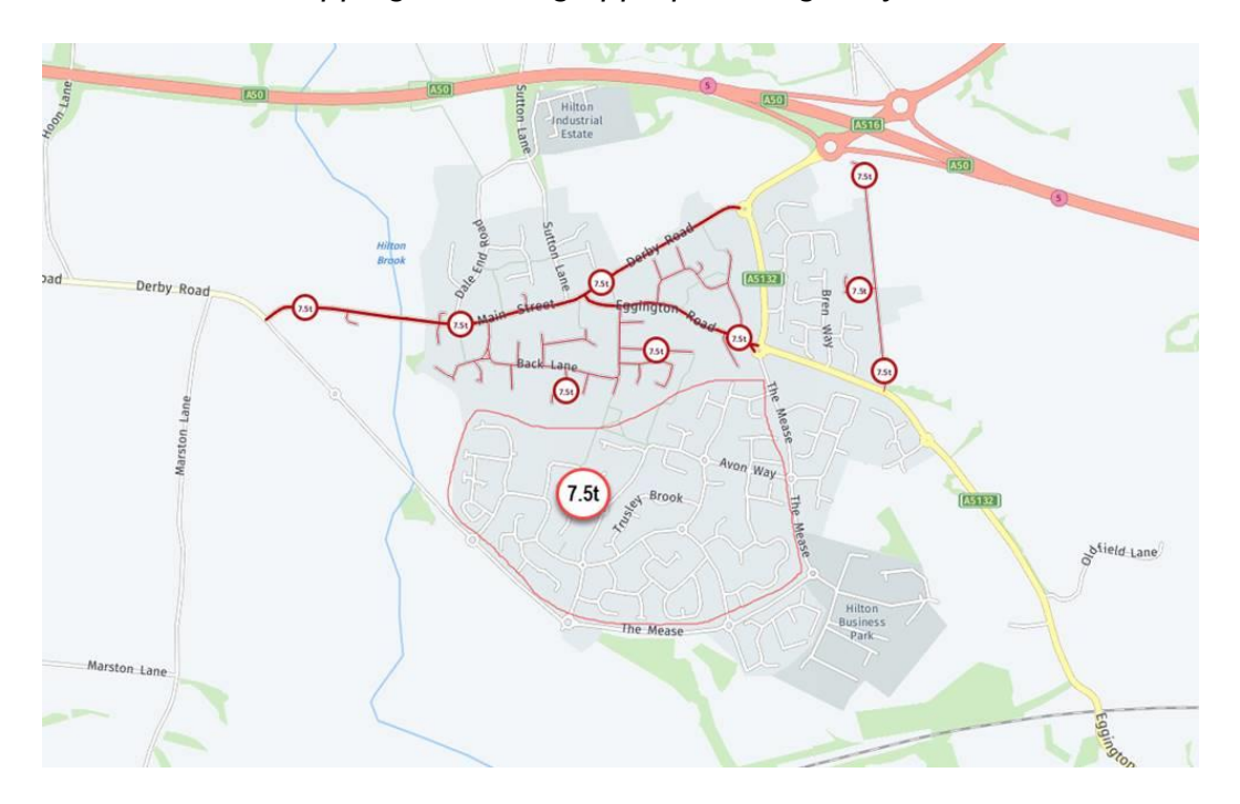
Therefore if a truck drive is using a truck specific satellite navigation device powered by HERE data then the vehicle won't be directed along the red route.

I would add that from the conversations I had with the Satellite Navigation providers and from some research I have done, is that HERE and TomTom do provide mapping applications for Smart phones and they are available on the latest Apple devices as well. I have had a number of conversations with my contacts at HERE and they recently visited the Highways Hub at Derbyshire County Council, they have a target audience of around 80% of the entire Satellite Navigation market and at their recent visit they discussed issues around mapping and using appropriate highway network routes.