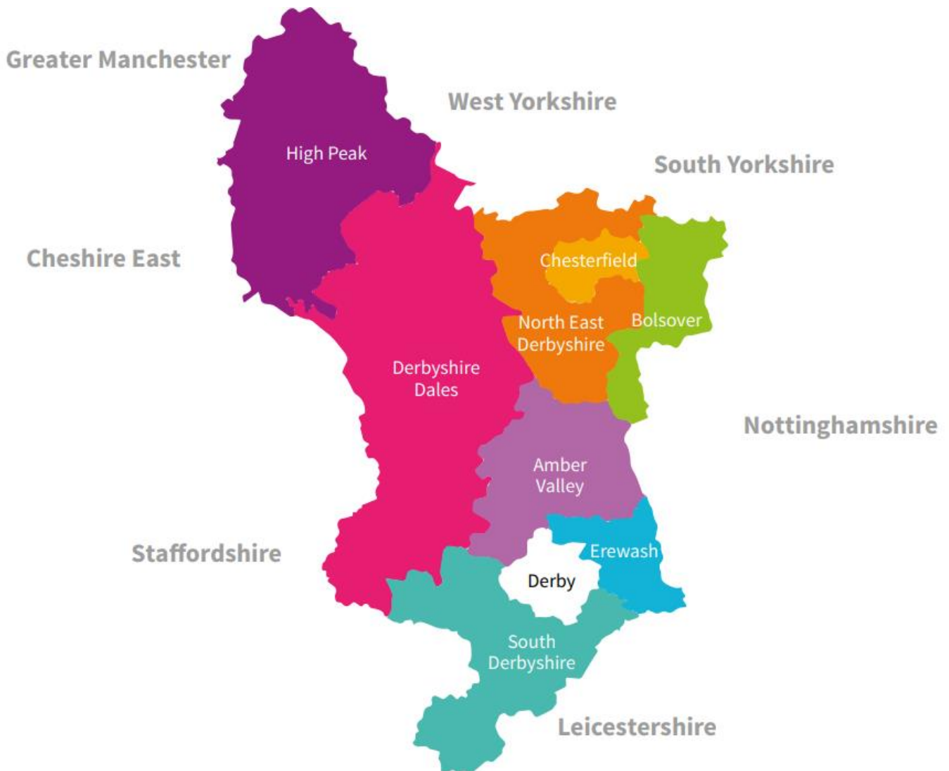
Figure 1 – Derbyshire Enhanced Partnership Area (excludes Derby City)

This Enhanced Partnership Scheme will support the improvement of all local bus services operating throughout the Derbyshire County Council area, excluding Derby City, as illustrated in Figure 1.