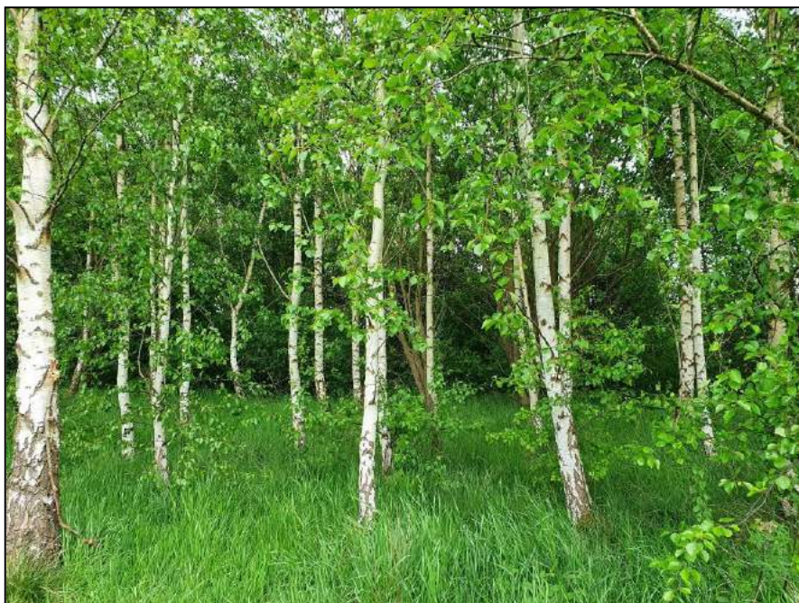
Photograph 4: Silver birch plantations

The plantation woodlands surrounding Salts Meadow are dominated by silver birch. Trees are young and all the same age and height structure. A small amount of natural regeneration is present with occasional pedunculate oak and goat willow Salix caprea on the margins. Ground flora was dominated by grasses including tufted hair grass Deschampsia caespitosa , tall fescue Festuca arundinacea and cock's-foot. Robust herb species including rosebay willowherb Chamerion angustifolium , creeping thistle, common nettle and field horsetail Equisetum arvense were also present. The woodland block adjacent to the road recorded slightly higher species diversity with young regenerating species included hawthorn, hazel Corylus avellana and horse chestnut Aesculus hippocastanum at relatively low abundances. Given the lack of species and structural diversity within the canopy, the visible planting lines and absence of large standing or fallen deadwood, the woodland blocks are assessed to be in poor condition .