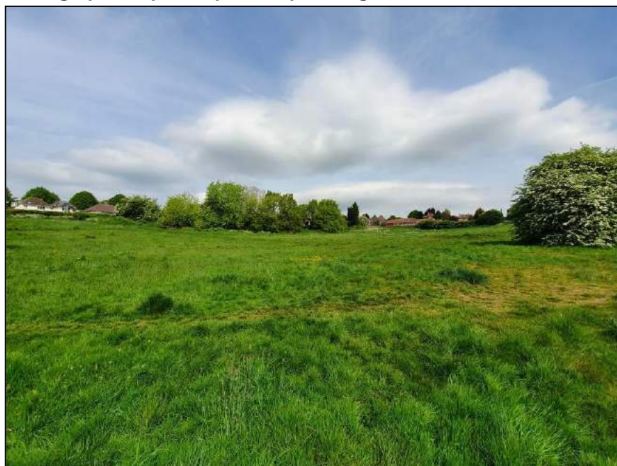
Photograph 2: Species poor, improved grassland

The grassland is characterised by dominant, fast growing grasses on fertile, neutral soils, with the abundance of perennial ryegrass above 25% in areas. In addition, the presence and abundance of undesirable species such as white clover, curled dock Rumex crispus , ragwort Senecio jacobaea , nettle Urtica dioica and creeping buttercup (undesirable species shown in red on Appendix 1 – Species Lists) confirms that the grassland meets the poor condition assessment criteria.