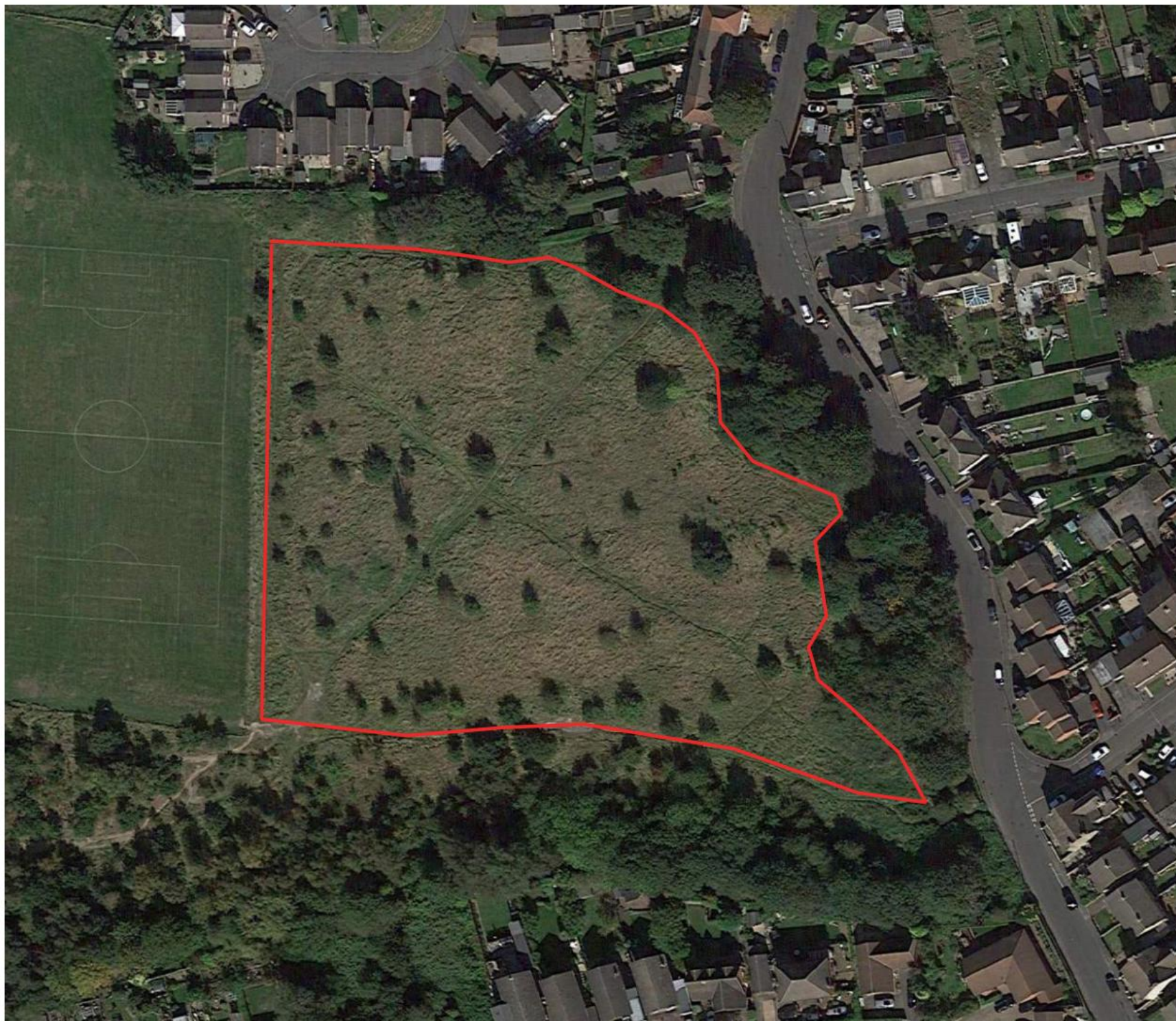
Site 2 Unnamed grassland at Church Gresley Semi-improved grassland 1.3Ha