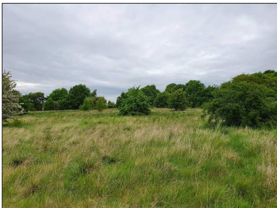
Photograph 3: Species poor, semi-improved grassland