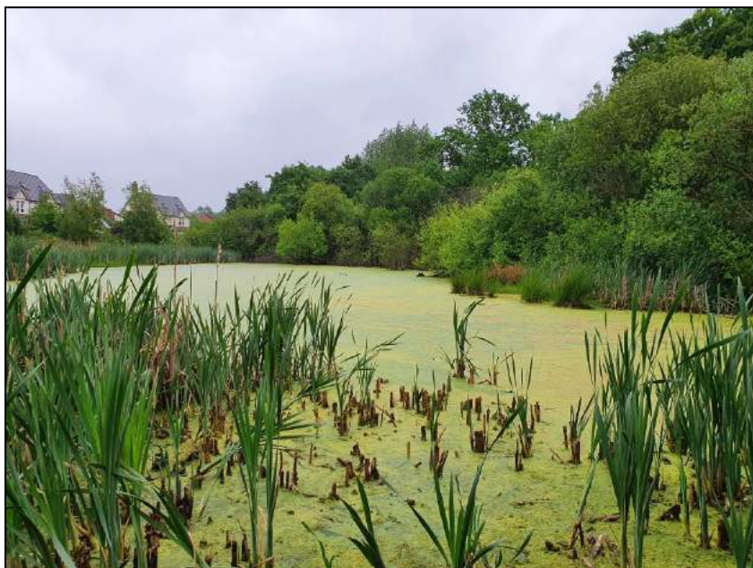
Photograph 1: Hall Wood pond

Three other SDDC sites were surveyed with the view to including their enhancement on this schemes BNG metric. Two of the sites, Salts Meadow and Swadlincote Woods, as a result of their existing moderate condition and an improvement in their management over the past few years by the councils Green Space team, were considered likely to achieve good condition over the next 5-10 years without further capital works. Therefore, any further enhancement and resources received through this scheme would demonstrate additionality and have therefore not been included. The third site, Hall Wood pond, while in poor condition and requiring enhancement works, was removed from the scheme due to the high risk of failure. The pond, shown in Photograph 1, was covered in a thick mat of duckweed caused by eutrophication. Before any enhancement work could take place, an investigation into the source of eutrophication would have been required and the findings of this would determine the success. Work was completed to try and include the pond, firstly for the importance of having good condition ponds within an LWS; secondly, to provide like-for-like habitat compensation for the loss of wetland habitats within the scheme, however, enough units could be achieved without the inclusion of the pond and it was considered the risk of failure was too high. Furthermore, enhancement of ponds is a very high cost to benefit ratio, with price per unit much higher than that of woodland or grassland.