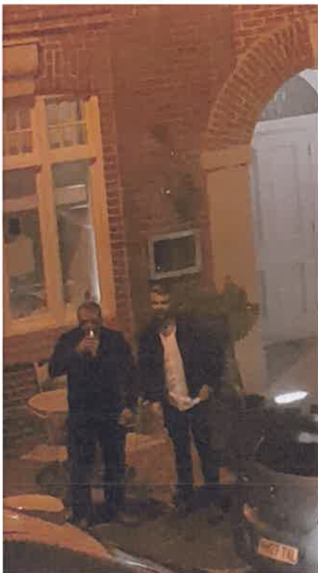
Fig 11/12 – drinking outside after 2000hrs screen shot of videos (20160910_224509 & 20160910_232128)