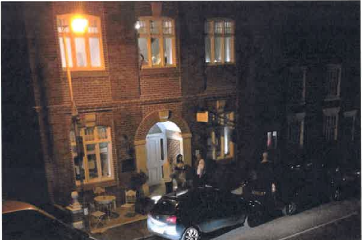
Fig 9/10 – incomplete license changes displayed in window, photo in window taken on Wednesday 14 th September, photo of license changes online, taken Monday 12/09/16.