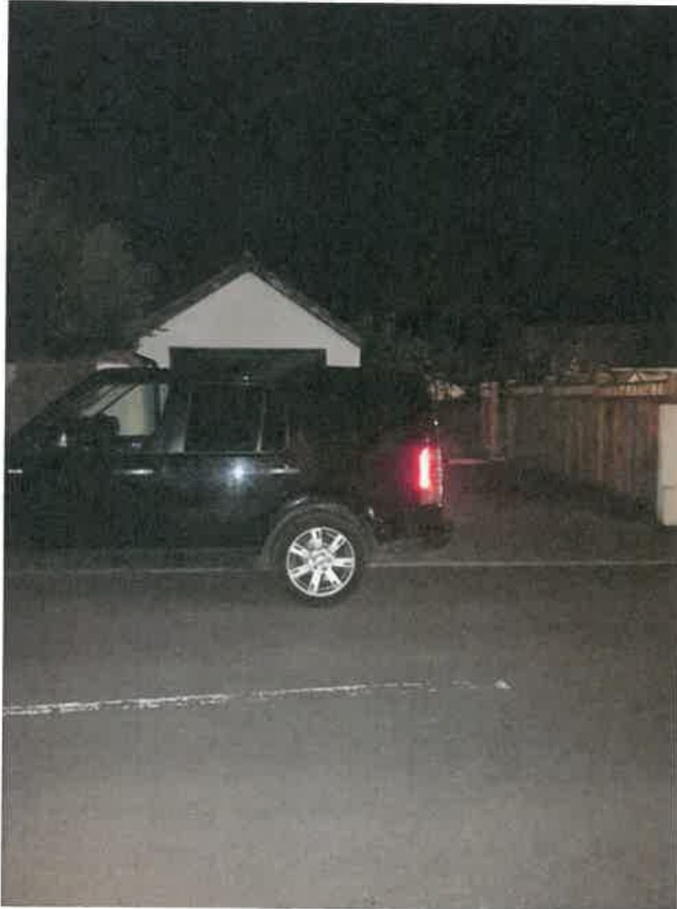
Fig 1 – Parking violation by Amalfi White Patron on 06/09/16 @ 2309

Supporting evidence – all times are estimates and are accurate to within 15minutes, please review CCTV footage from the premises to confirm exact time stamp. Dates are all accurate.